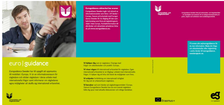
Brochure presenting Euroguidance Sweden